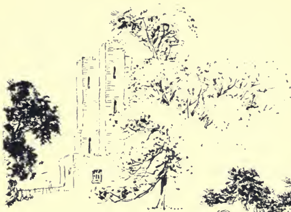
Cranborne Tower a resort of Henry VIII & his wife